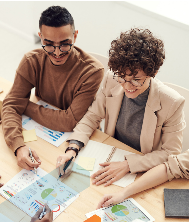
Tableau products transform the way people use data to solve problems, and as 2017 Tableau Partner of the Year, CoEnterprise has empowered users across the country with superior product know-how, informative training and optimized implementations. No matter how complex the project or customer, CoEnterprise maximizes the value of Tableau and enables users to take back control over their data.